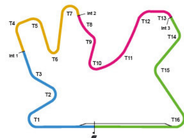
LOSAIL, QATAR Circuit Length - 5,380 Km