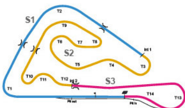
Slovakiaring Circuit Length - 5,922 Km